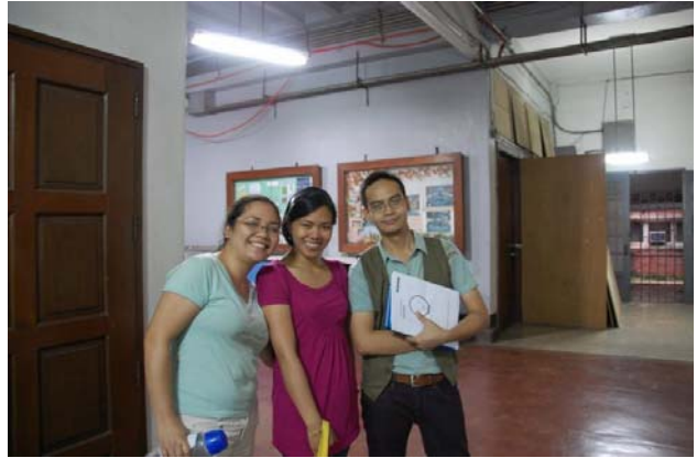
Interaction with other students.

The classes are held in English. The textbooks being used are also in English. During research and ordinary day-to-day conversations, Filipino (the National language of the Philippines) is commonly used. However, everybody can speak and understand English so language is not a problem for foreign researchers. Even outside the university like at the department store, restaurant, or supermarket, English is widely understood and spoken by almost everybody. This makes life easier for a foreign researcher who cannot speak and understand Filipino.