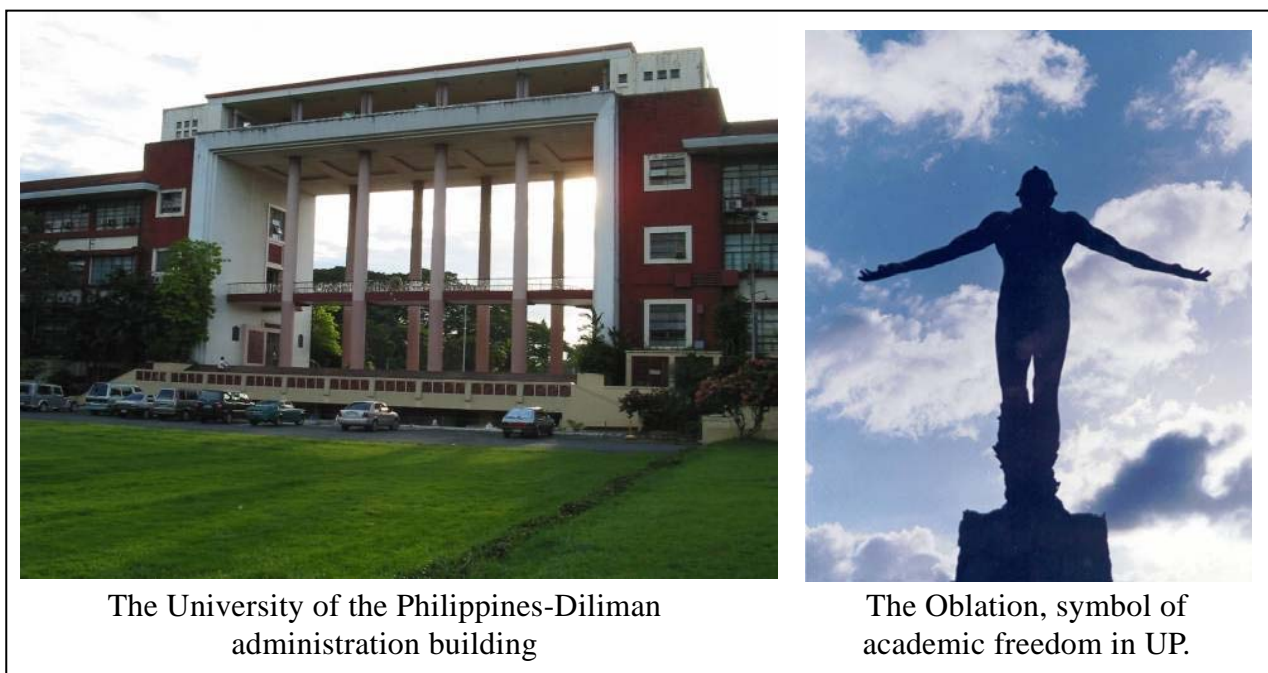
The University of the Philippines-Diliman administration building

On the other hand, the University of the Philippines (UP) was established in 1908. It is the only national university in the Philippines. It has seven constituent universities located in 12 campuses throughout the Philippines, where about 50,000 students thrive. The biggest and the main campus is in Diliman, where the National Institute of Physics is also located. UP's constituent universities offer 246 undergraduate and 362 graduate programs.