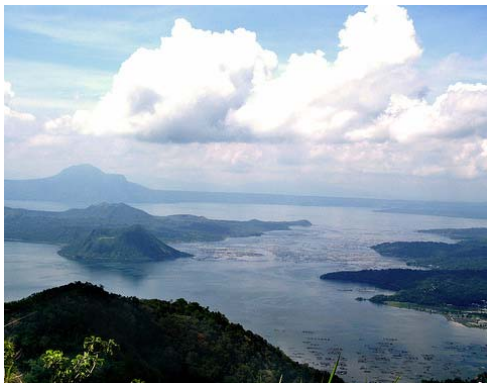
Taal lake as viewed from Tagaytay.