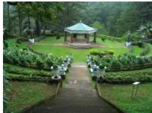
Camp John Hay in Baguio City.

round. Even when Metro Manila is 25-32 °C, Baguio City has temperatures around 15-26 °C.