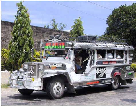
Jeepney: Major mode of transportation.

The Philippines is a tropical country in south-east Asia. It consists of 7,107 islands which are classified into three major groups, the Luzon, Visayas, and Mindanao. Manila, the capital, is located in Luzon. So is the National Institute of Physics and the main campus of the University of the Philippines. As of 2008, the population is estimated at 90.5 million. The currency is the Philippine peso. The major transportation in the Philippines is the jeepney . Since it is a tropical country, it has two seasons, wet and dry. I also had the opportunity to visit some of the tourist attractions. Among these are Tagaytay and Baguio City. Tagaytay is 55km from Metro Manila, the capital of the Philippines and where the National Institute of Physics is located. Tagaytay is a famous tourist spot because it offers a breathtaking sight of the famous Taal Lake - a lake within an island within a lake. On the other hand, Baguio City is about 300 km north of Metro Manila. It is the “summer capital” of the Philippines because of its cool climate all year