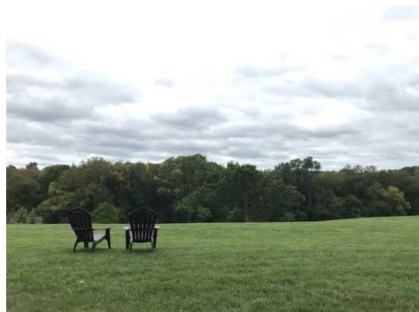
IBM Thomas J. Watson research center in Yorktown Height New York USA

Before leaving, I had to prepare many documents for the visa document, the travel plan, and the research plan.