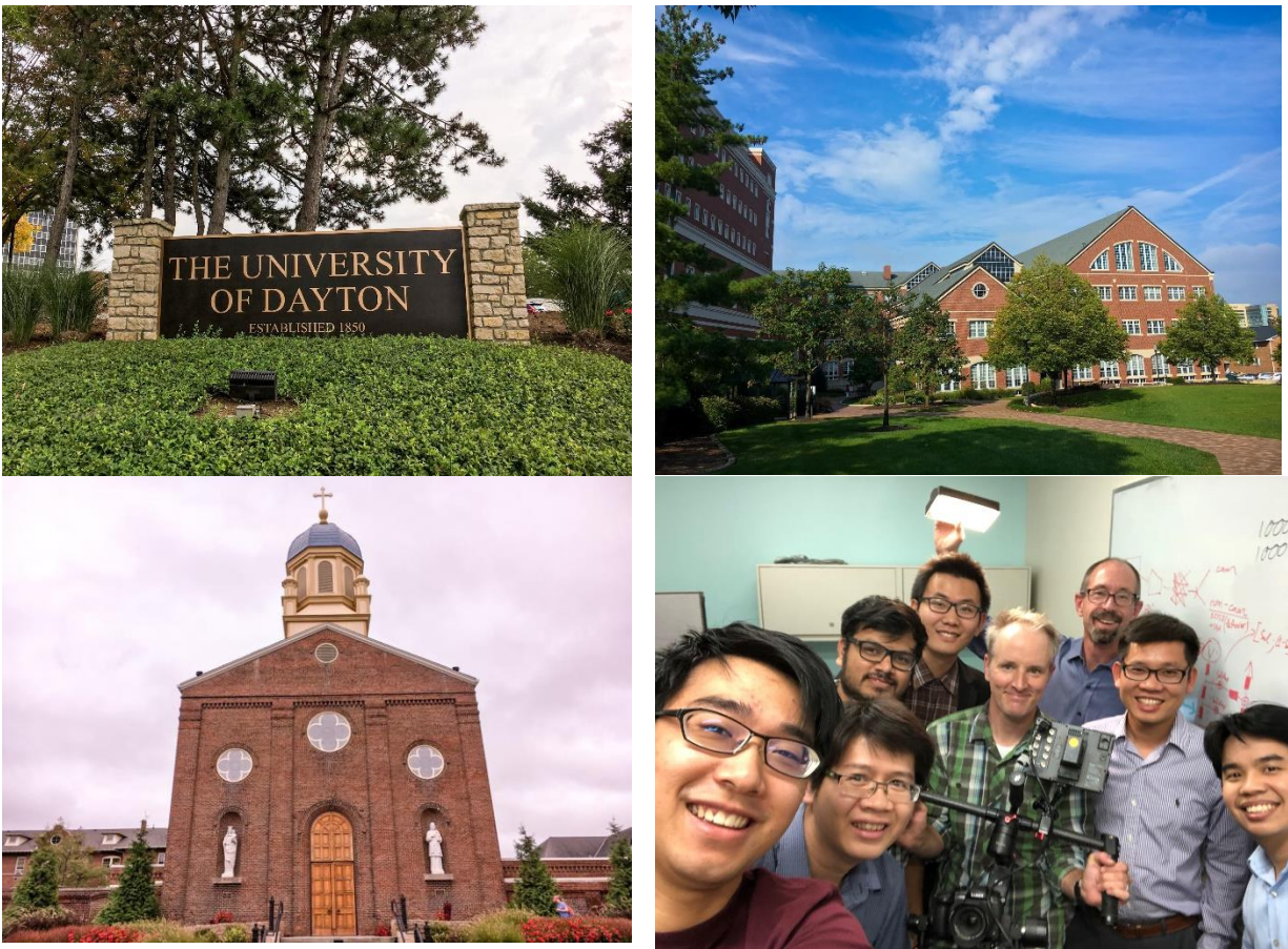
Figure 3. Vision and Mixed Reality Lab, University of Dayton.