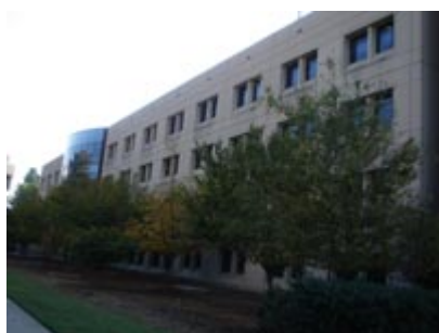
- Duke Univ. Dept. of Neurobiology -