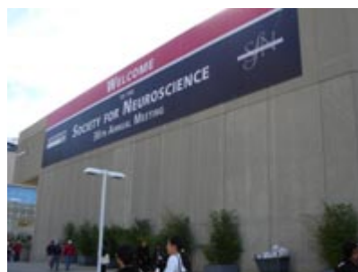
- SFN Center -