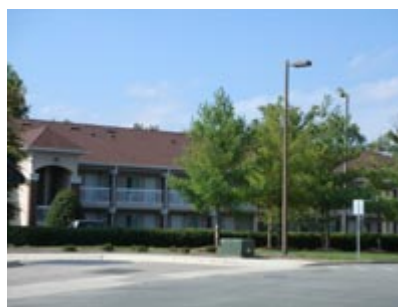
- Logde -